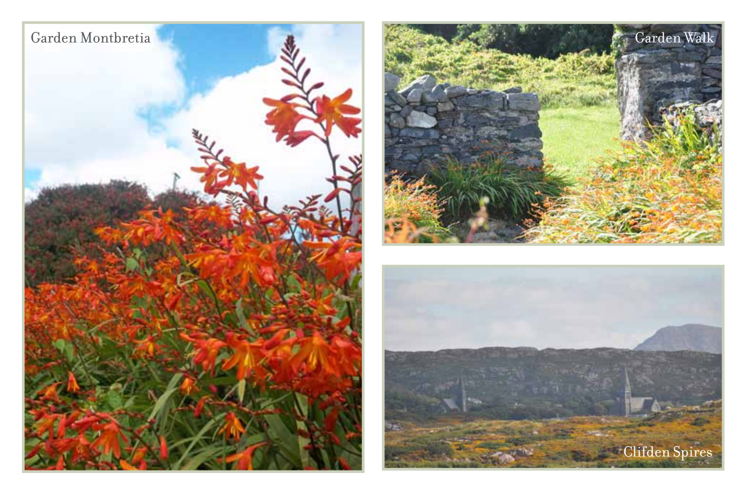
ERRISLANNAN HOUSE, CLIFDEN, CO. GALWAY, IRELAND