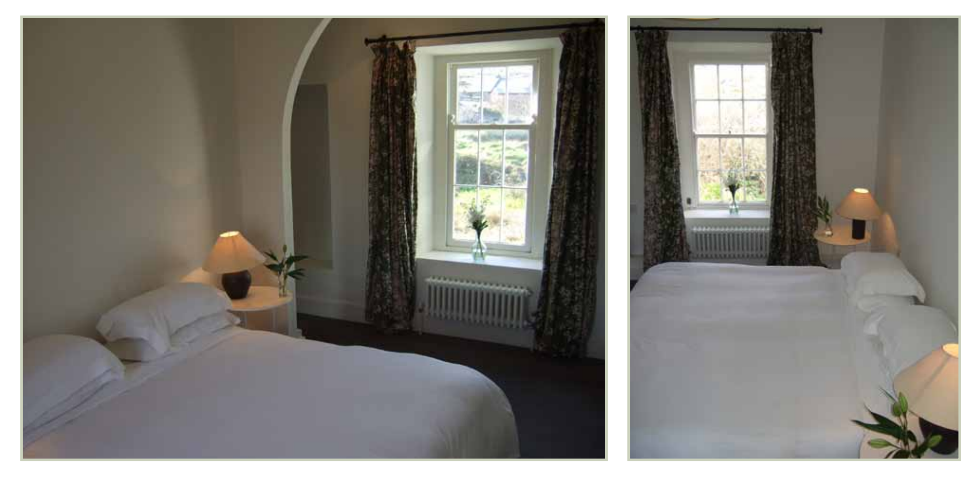
ERRISLANNAN HOUSE, CLIFDEN, CO. GALWAY, IRELAND