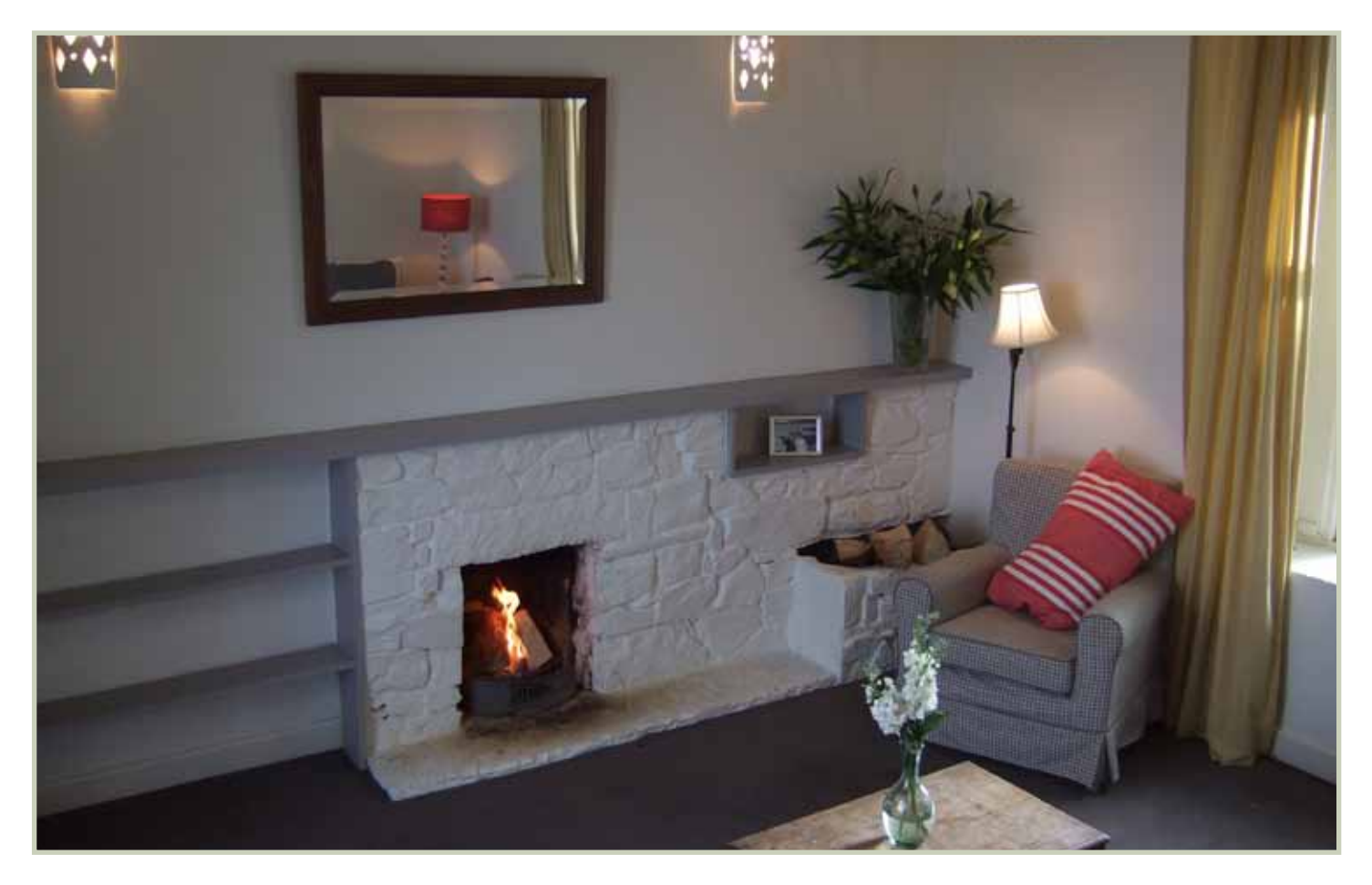
ERRISLANNAN HOUSE, CLIFDEN, CO. GALWAY, IRELAND