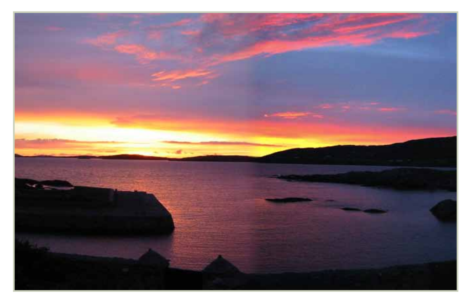
ERRISLANNAN HOUSE, CLIFDEN, CO. GALWAY, IRELAND