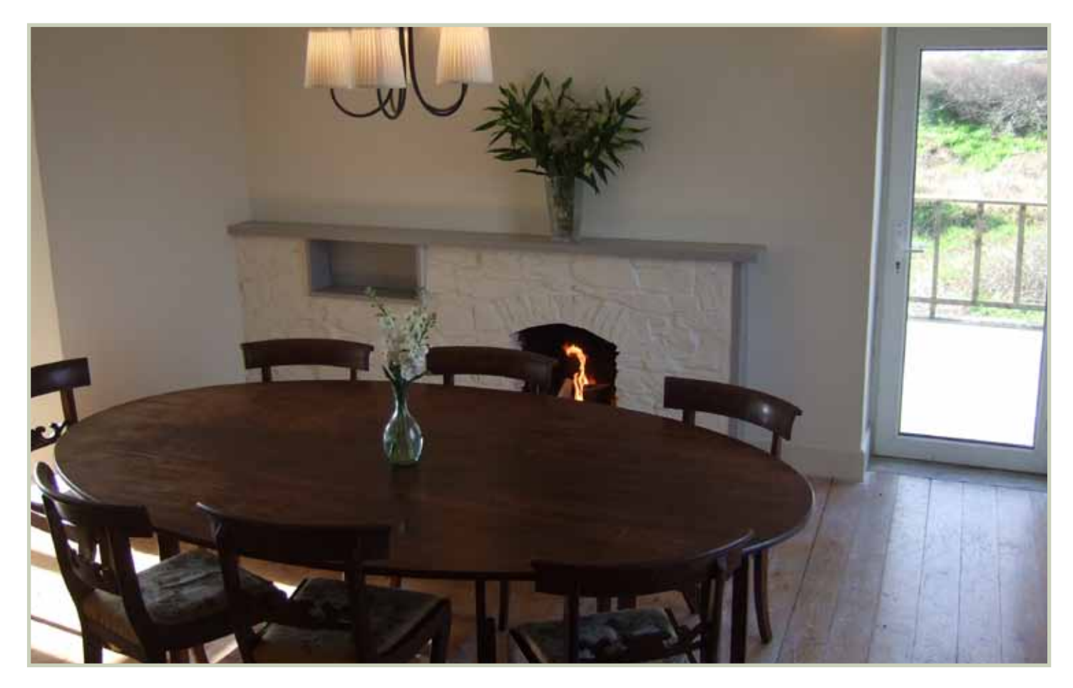
ERRISLANNAN HOUSE, CLIFDEN, CO. GALWAY, IRELAND